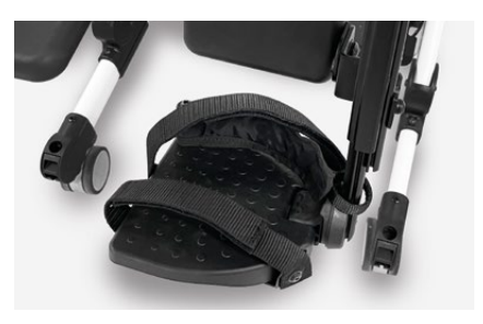
962 Footrests + Heelrests