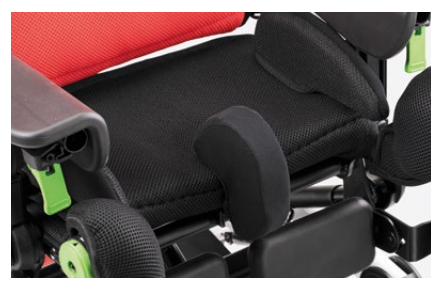
834N Narrow abdduction block Adjustable in depth along with the seat. Available in two sizes.