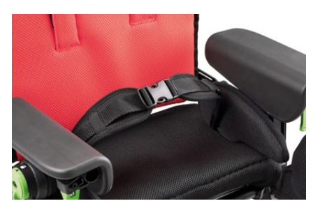
947 Pelvic belt with variable angle Available in three sizes. Provided as standard.