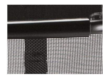
Load bearing upholstery

> Removable cover is made by very breathable and high quality material both internally and externally. The inner padding has a highly innovative leading edge structure, that is three-dimensional, lightweight, providing extremely high air circulation, optimal weight distribution and excellent comfort. The external fabric is highly resistant to abrasion too. Fire retardant according to EN 1021-1:2014 and EN 1021-2:2014 standards.