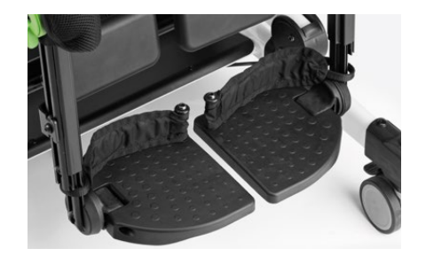
960 Heel rests

It is made of resistant and hygiene material, no edge design, it does not retain any residue of food.