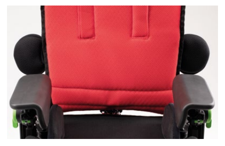
961 Elbow side supports