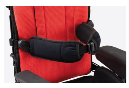
868 Wrappable and flexible trunk supports Adjustable in height, width and rotation. Available in two sizes.

Covered by breathable padding fabric, removable for washing.