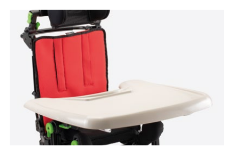
824 Tray with wrap-around recess Adjustable in depth, height and tilt with