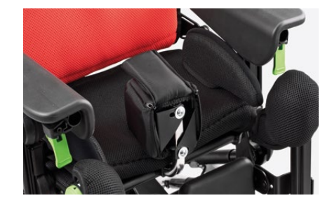
834R Adjustable abduction block in depth and abduction. Available in two sizes.