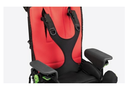
853 slim Four point shaped harness