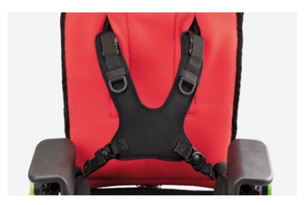
853 Vest harness Available in two sizes.