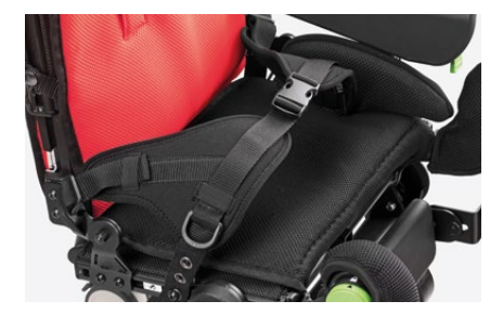
920 Four point pelvic belt Available in two sizes.