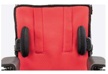
838 Trunk side supports Adjustable in height, width and rotation. Available in three sizes.

Covered by breathable padding fabric, removable for washing.